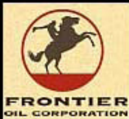
Frontier Refining and Marketing