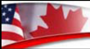
Canadian Consulate General